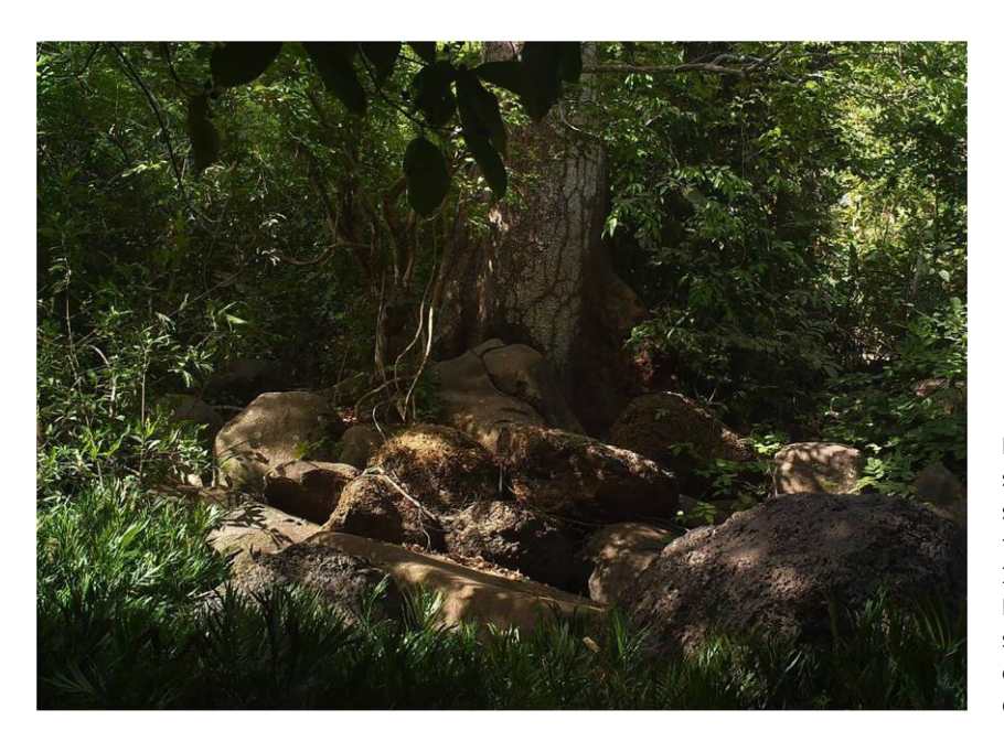
Figure 1: A focal chimpanzee accumulative stone throwing Ceiba pentandra tree in the sacred gallery forest of Capebonde, picture taken by a Bushnell camera trap 7 May 2013 at 15h36. Big flat rocks are surrounding the tree on which a chimpanzee group may sit and play. Tree diameter at breast height is ca. 3.6 m.