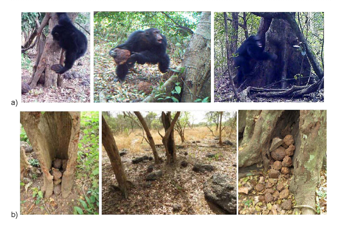
Figure 2. Photographs and stills of accumulative stone throwing behaviour and sites. (a) Adult male chimpanzee tossing a stone; hurling a stone (Boé, Guinea-Bissau); and banging a stone (Comoé GEPRENAF, Côte d'Ivoire). (b) Boé, Guinea-Bissau landscape: stones accumulated in a hollow tree; a chimpanzee accumulative stone throwing site; and stones accumulated in-between buttress roots (see also Supplementary Movies 1–7).

Chimpanzee accumulative stone throwing behaviour. Thirty-one TRSs located within the Pan trog-lodytes range were sampled between 2011 and 2015 for a period of 14–17 months. An additional three TRSs were on-going and studied for less than 14 months, for a total of 34 (see Supplementary Table 1). At four TRSs: (Boé,