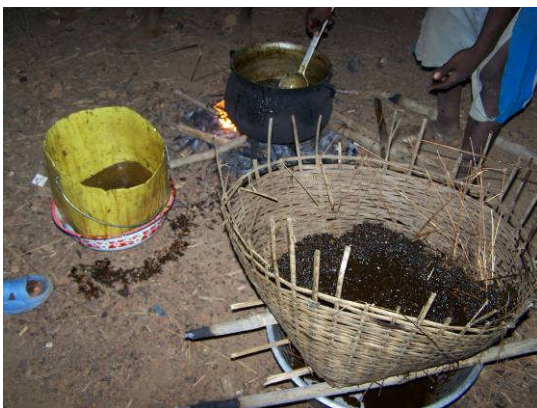
Picture 3 Honey sieving