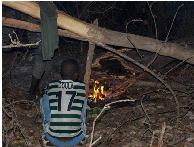
Picture 1 honey gathering from a tree trunk

In CheChe they said that there is one man from Bissau that collects honey and wax once a year in the West of Boé. None of the other villages visited mentioned this. Some honey is sold in Gabu through 'public' transport. The price of one kg honey is 450 CFA from this price 100 CFA is tax to be paid to the forest-guard.