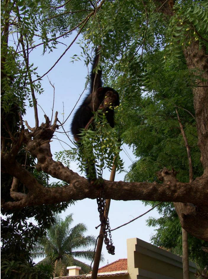
Picture 6 Young male Chimpanzee, Bissau centre.

The story goes that he bought all animals that were offered to him or that he could catch. The buyer stayed in Dandum for a few days or weeks.