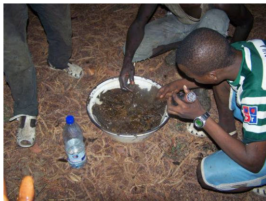
Picture 3 Collected honey